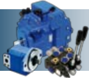
Hydraulic Components and Systems