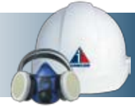
Safety and Personal Protective Equipment