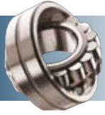
Bearings and Power Transmission Products