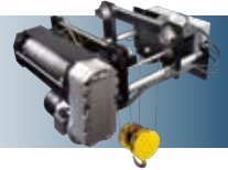
Material Handling Equipment